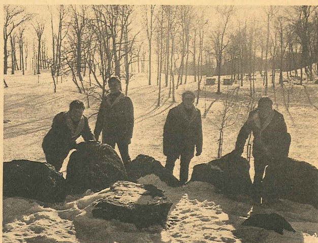
The Sceptres, from Montreal, have the makings of a solid chart item in "Something's Coming Along" and "What's The Matter Juliette (Allied 6353).