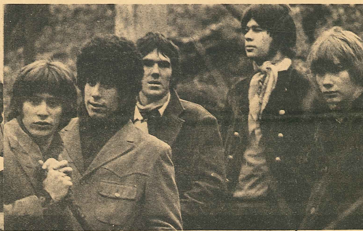
The Blues Magoos, who record under the Mercury banner have just completed their latest LP "Basic Blues Magoos".