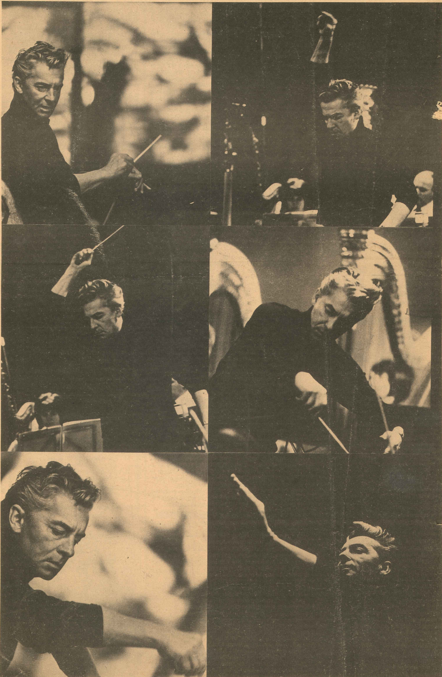
Herbert von Karajan conducting in Montreal

Herbert von Karajan has too much going for him to sink into regression as do many who have past the three score mark. His youthful approach to the musical needs of today, and indeed his youthful personality and physical being are sound reasons why Karajan will be regarded for his musical accomplishments rather than his span of years. There is still much that he can uncover, whether it be new works or old, the Karajan touch