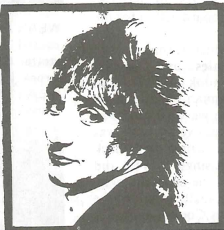
DOWNTOWN TRAIN Rod Stewart Warner Bros - 92-26857-P