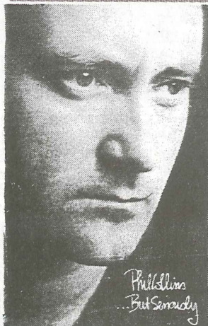
PHIL COLLINS But Seriously Atlantic - 78-20501-P