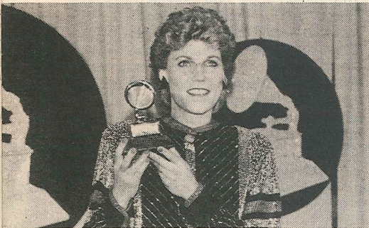
Anne Murray with her Grammy, won this year for her single, A Little Good News .

Murray won her fourth Grammy at this year's 26th Annual Awards show (Feb. 28)