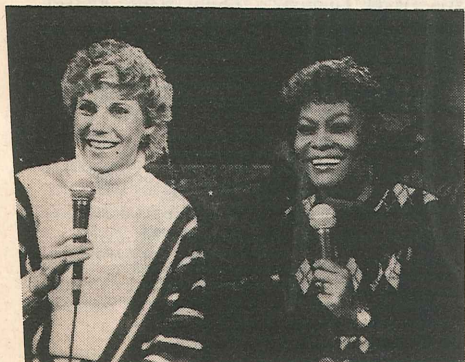
Anne Murray seen here with Dionne Warwick taping her CBS Special from Quebec City.