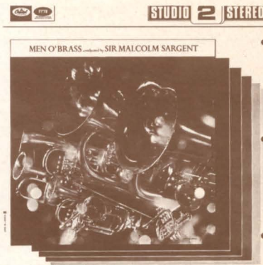
MEN OF BRASS

DEALERS - MAKE SURE YOU SEE OUR REPS FOR YOUR DISPLAY KIT!