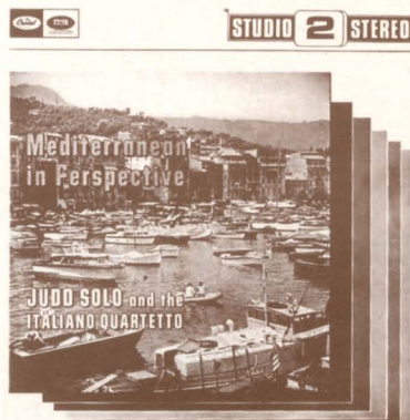
MEDITERRANEAN IN PERSPECTIVE