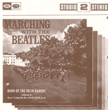
MARCHING WITH THE BEATLES