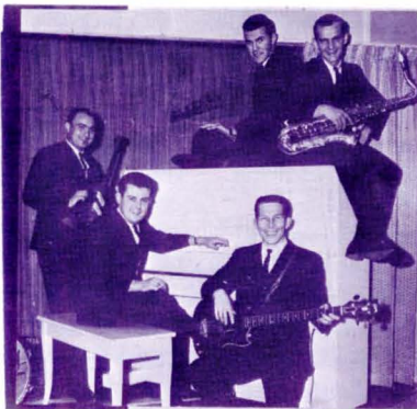
Little Caesar & The Consuls