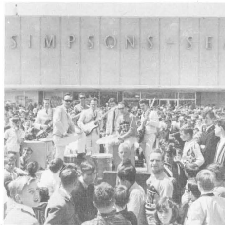
The Jury, sensational new group from Winnipeg, have just released "Back In My World" on London.