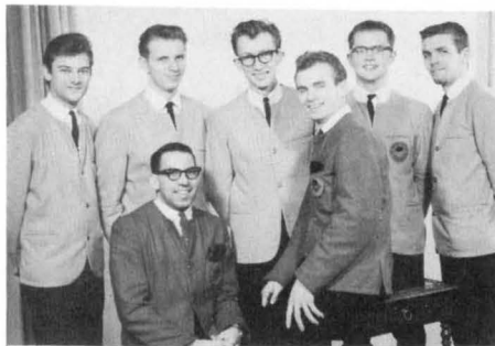
The Canadian Downbeats are experiencing good regional action with their Soundaround release of "That's The Way". The Downbeats hail from Regina and are set for a U.S. tour the latter part of February.