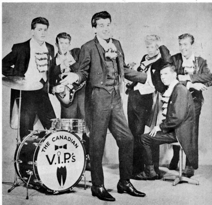
THE CANADIAN V.I.P.'s — a very popular Vancouver based group who have just released their single on Aragon "Monsoon".