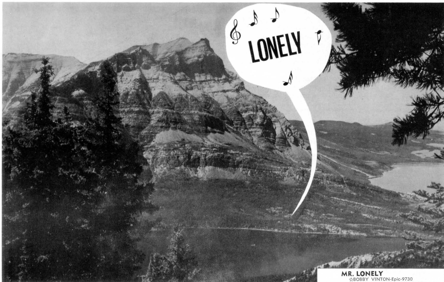
MR. LONELY ☆BOBBY VINTON-Epic-9730